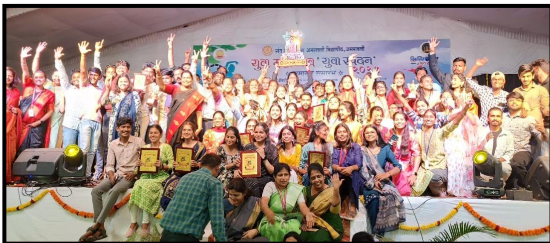
Student receiving the Champion Trophy of Sant Gadge Baba Amravati University

By clinching the General Championship Title yet again, Shri Shivaji Science College, Amravati , has proven that Excellence is not just a habit — it is a culture .